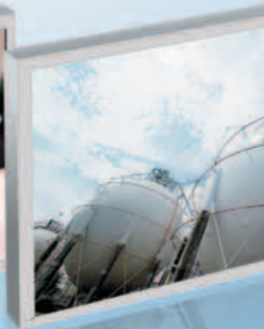
■ Yongyeon plant Propylene Ball Tank