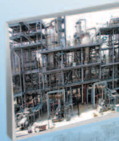
■ Yongyeon Plant PP Process