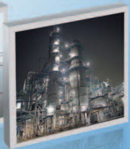
■ Yongyeon plant DH Process