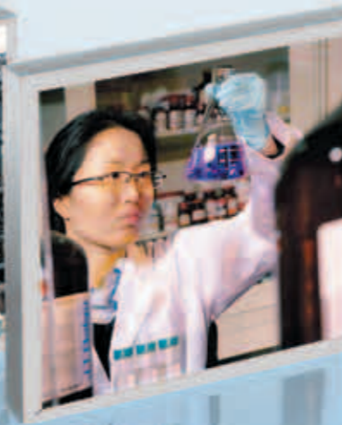
■ Production R&D Center